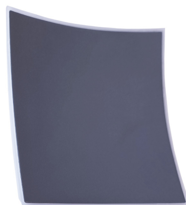
CRISTAL1 (Dark Grey)